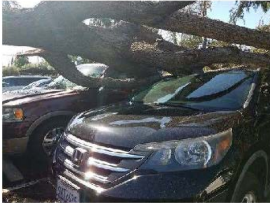
Time: 08/19/2018 06:53 (Pacific Daylight) Description: