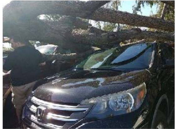
Time: 08/19/2018 06:53 (Pacific Daylight) Description:

These are photos provided to us from The Pruneyard Management Office after one of the 4 cedars failed.